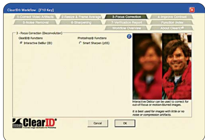
One of the features of the software is a Workflow menu with tabs that guide you through a seven-step image-clarification process: Correct Video Artifacts; Resize and Frame Average; Focus Correction; Improve Contrast; Noise Removal; Sharpening; and Verification Report. The menu on the left illustrates noise removal using Pattern Remover. The one on the right illustrates focus correction using Interactive Deblur.