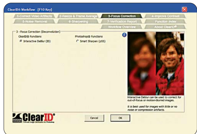
One of the features of the software is a Workflow menu with tabs that guide you through a seven-step image-clarification process: Correct Video Artifacts; Resize and Frame Average; Focus Correction; Improve Contrast;